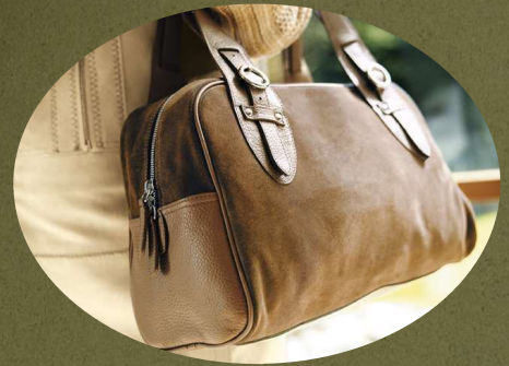
BAGS & SUITCASES