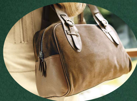
BAGS & SUITCASES