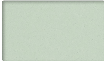
9048 Celandon Glaze