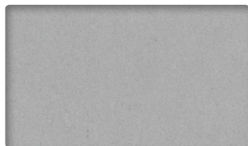
D030 Silver Lining